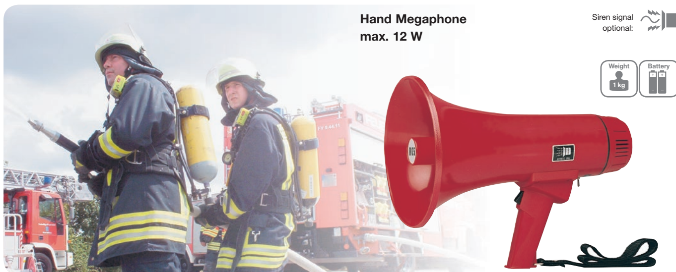
Hand Megaphone max. 12 W